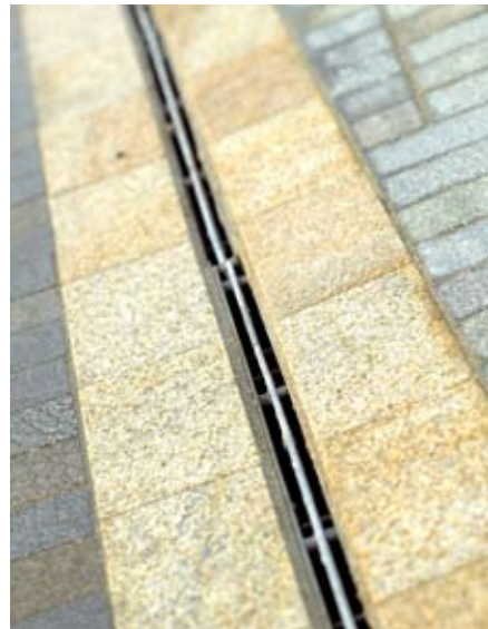
Marshalls Duo Slot Drain

This is truly a world class scheme on a World Heritage site that everyone can be very proud of. Marshalls will be involved in providing hard landscaping solutions to the North-End of the scheme to be completed along with the central Ferry Terminal in the near future.