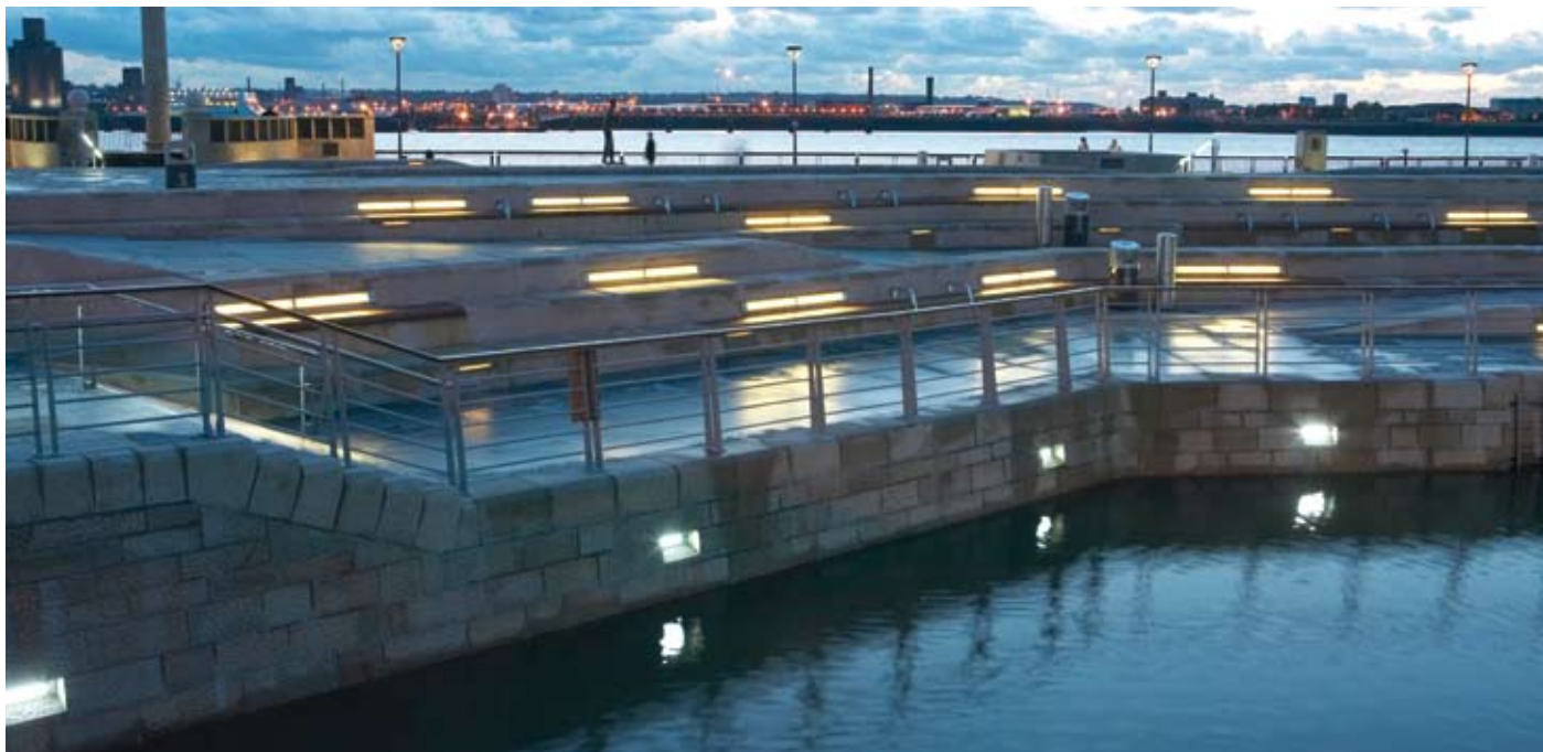
Inset lighting show off the Granite at night