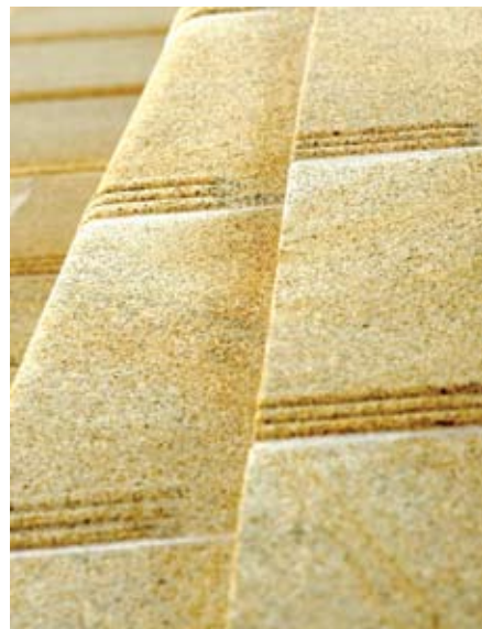
Marshalls' Granite anti-skateboarding units