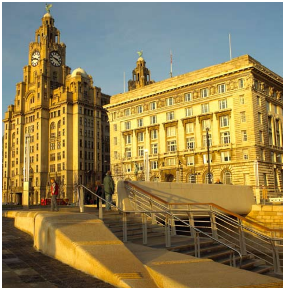
Light Beige Granite Street Furniture