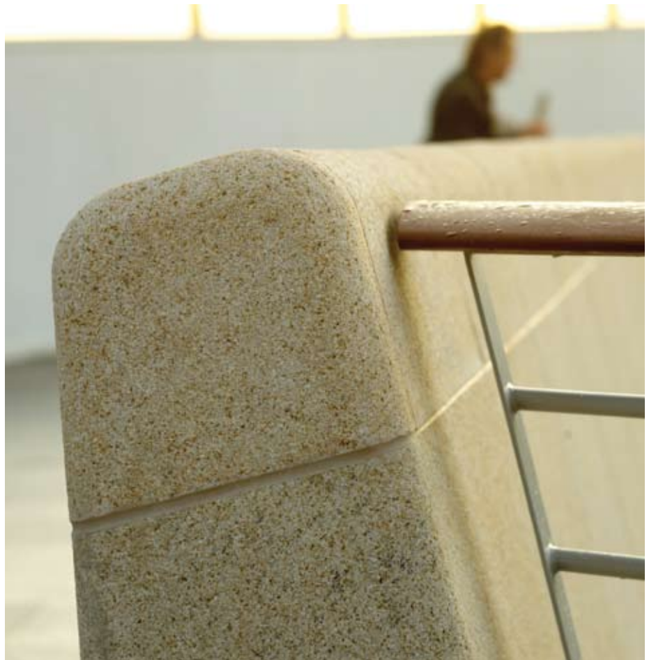
Marshalls' Granite Paving compliments its World Heritage site surroundings

The finished product is a credit to the professional approach of Marshalls from concept through to design and delivery of the scheme. The quality of the finished product could not have been achieved without the open and honest working relationship between Marshalls and BBCEL. The scheme pushed the boundaries of what can be achieved with natural stone and Marshalls played an invaluable role in delivering this world-class public realm space."