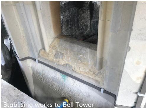
Stabilising works to Bell Tower