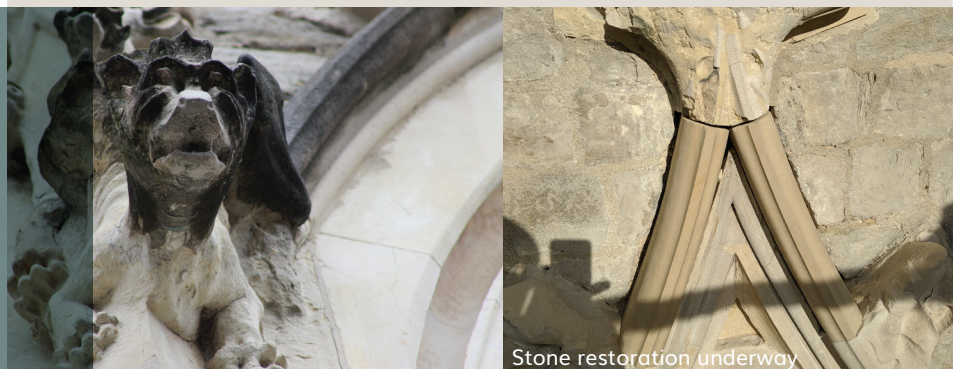
Stone restoration underway

"One of the most imposing and most influential of the early public cemeteries".