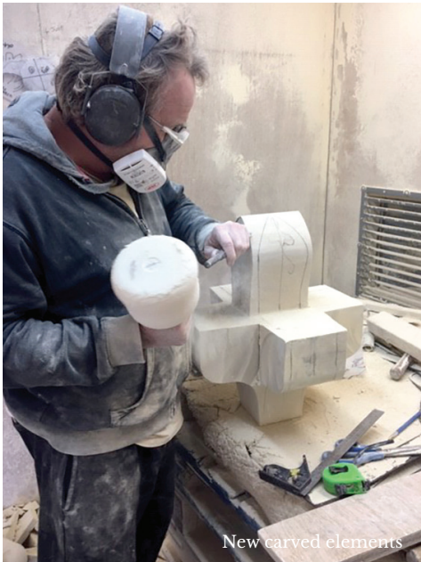
New carved elements