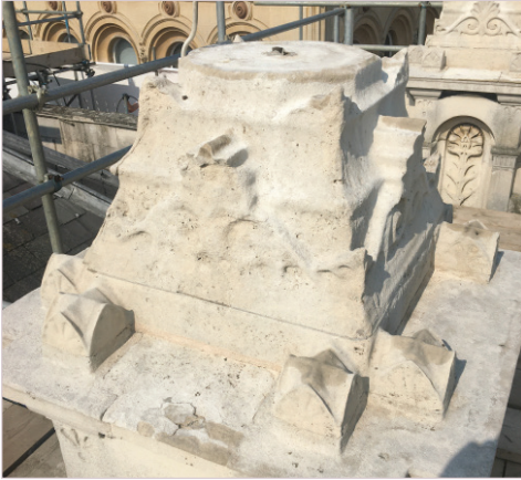
Stone Cleaning & Bases for Urns