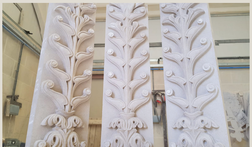
Completed new carvings for Pepper Pots