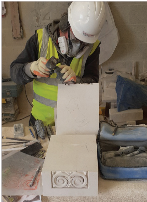
In-house mason carving new panels