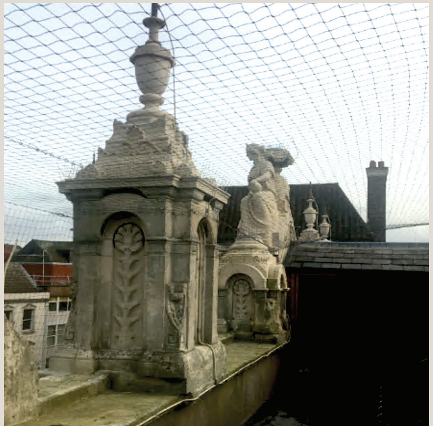
Works in progress