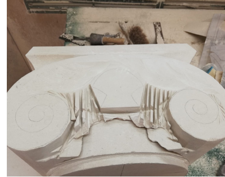
Carving new capitols in our workshop