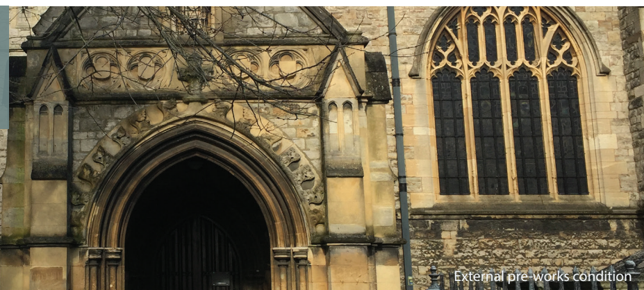
External pre-works condition