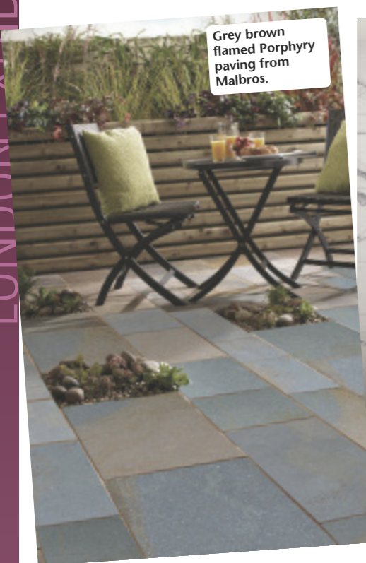
Grey brown flamed Porphyry paving from Malbros.