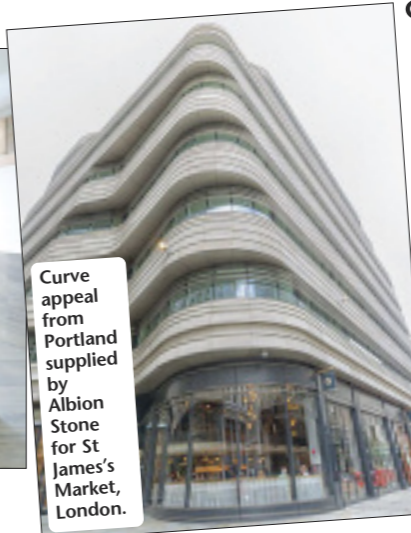
Curve appeal from Portland supplied by Albion Stone for St James's Market, London.