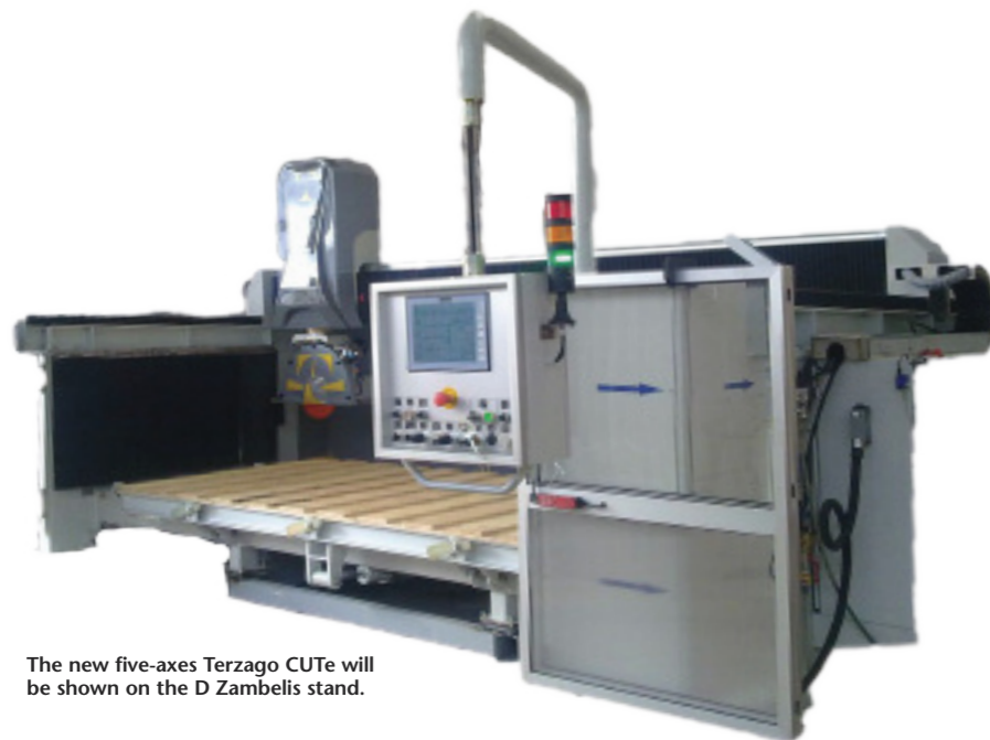
The new five-axes Terzago CUTe will be shown on the D Zambelis stand.