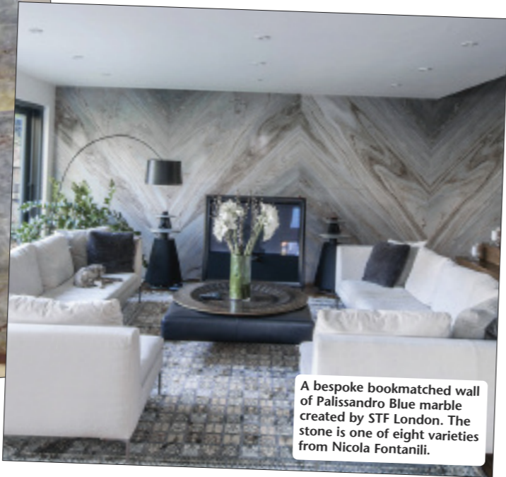
A bespoke bookmatched wall of Palissandro Blue marble created by STF London. The stone is one of eight varieties from Nicola Fontanili.

inspire with its premium interior collections; Century Stone specialises in stone cladding products, including its DecoStone, Eldorado and Mathios ranges; Rocks Forever presents materials directly from its own factories in India; Stone Consulting will display hand-finished limestone flooring from its Moroccan factory as well as large, lightweight natural stone Marmo Panels measuring 1200mm x 2400mm x 12mm thick; there are lightweight honeycomb panels from LMC products; Global Granite presents marble, quartz and its exotic granite selection that includes Fusion Gold, Stonewood and Antique Brown Leather; and Trans-European Stone will be showing its Pierre Bleue Belge limestone.