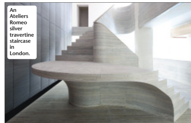
An Ateliers Romeo silver travertine staircase in London.

Whether you're a seasoned user of stone or a novice to the sector, working in new build or conservation, commercial or domestic, construction or interiors... whatever you are asking of stone you'll find an answer at the Natural Stone Show 2017.