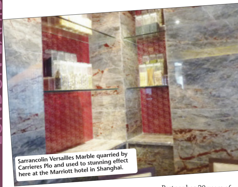
Sarrancolin Versailles Marble quarried by Carrieres Plo and used to stunning effect here at the Marriott hotel in Shanghai.