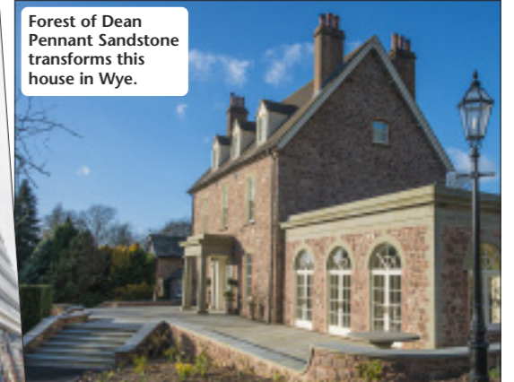
Forest of Dean Pennant Sandstone transforms this house in Wye.

brown Ironstone of Great Tew; Gallagher Group's Kentish Ragstone; Artisan Stone Supplies' Gwrhyd Pennant; Johnsons Wellfield's Crosland Hill hard Yorkstone; Welsh Slate's Heather Blue slate from Penrhyn Quarry; Lamb Group's Wealden Sussex Sandstone.