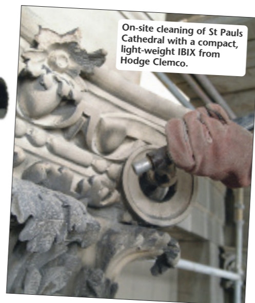
On-site cleaning of St Pauls Cathedral with a compact, light-weight IBIX from Hodge Clemco.

customers with the promise of an announcement at the Show, but says it cannot talk about yet because there are still a few 'T's to be crossed and 'I's to be dotted.