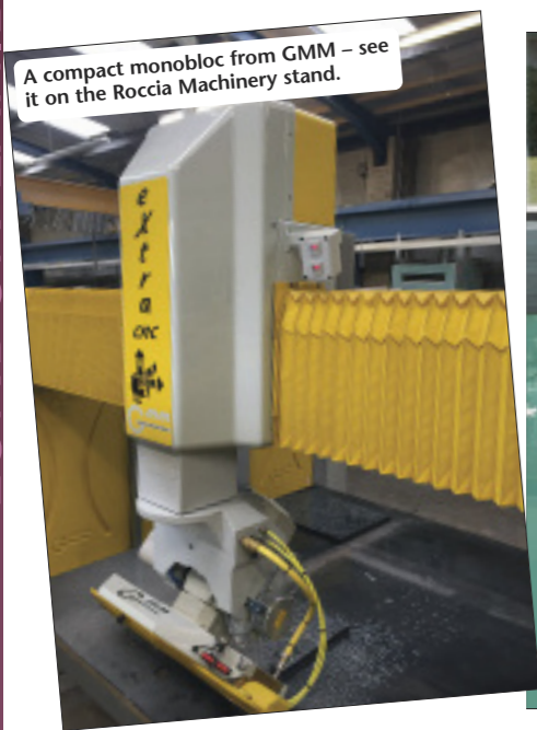
A compact monobloc from GMM – see it on the Roccia Machinery stand.