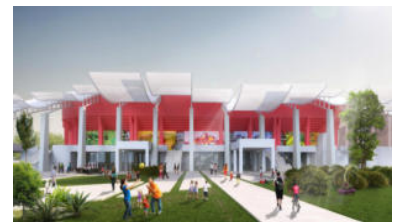
Polideportivo - € 44m