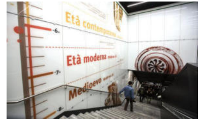
S. Giovanni Station - € 7m