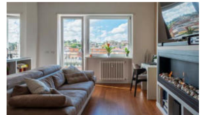
Mirto House - € 0,14m