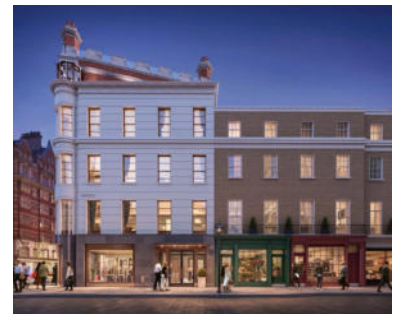
55-93 Knightsbridge - £ 0,6m

- In charge of the finishing project (floors, walls, ceiling) - Concept design (colours, patterns, textures) - Preparation of the presentations for our client - Coordination with other disciplines (commercial and technical architects) - Production of details, drawings and documents for the final package