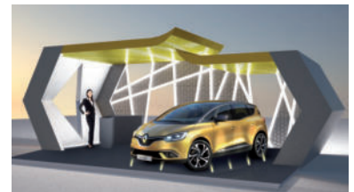
Renault stand - € 0,05m