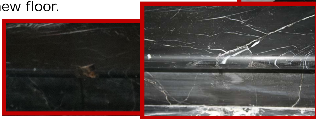
Far left: Original broken step Left: Repaired step before cleaning and polishing Above: Existing floor cleaned and polished Below: New floor in adjoining conservatory

“Now that John Montgomery has finished laying the marble floor in our conservatory and repairing our marble floored wine room, I feel I must let you know how impressed I have been with your professionalism from the day I contacted you through to the completion of the job.